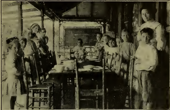
LEARNING DOMESTIC SCIENCE AT ROCK HILL.

studied in connection with the measurements of the plots, the planting of the seed, the weighing and estimating of the crop, the study of the soil, the building of the fences. After the youngest children have laid out their garden plots and planted their seed, they must label the beds and make notes in their